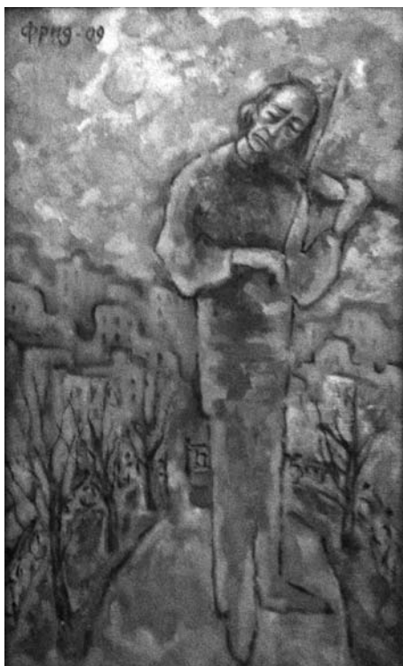
Example 9. Jerusalem (2009)

Let us note one more particular detail: both the relief and the background are depicted in one palette. However, the light grey range of colours without using abrupt colour strokes chosen by Frid, does not leave the viewer indifferent due to a special plasticity of light and shade compared with the play of harmonic colours in a piece of music.