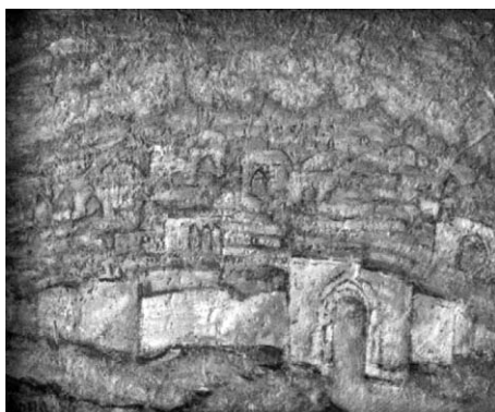
Example 8. Jerusalem (1998)