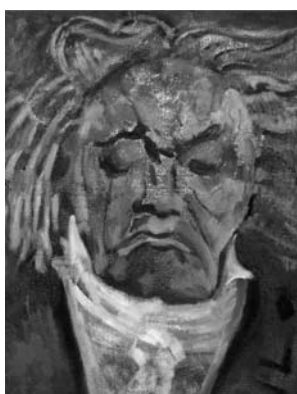
Example 3. The portrait of Bethoven (2007)