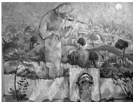
Example 7. Jerusalem (2007)