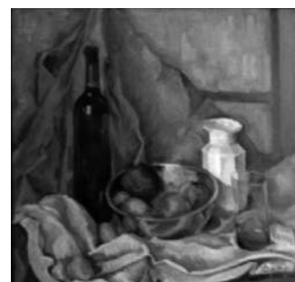
Example 4. Fruit-piece (1980)

The composer was especially fond of "Self-portrait" of 1979 (Example 5). The figure of a person absorbed in thought: slightly bent head, high wrinkled forehead, closed eyes, hands propping up the chin. A person who went through a big shock... Severe pre-war and war years, the faces of dear people who are gone, are stored in his memory forever. Diverse positive events connected with teaching profession, Musical youth club, warm family circle and close friends can hardly cross them out. Metaphorical are the branches of a bare tree, the bends of lines of which are filled with movement – the movement of thought of a mature person. A picturesque image of bare branches we can see in the picture "The portrait of father". Blue-coloured branches associated with winter nature that had fallen asleep is a symbol of a stopped time, human memory and generations tie. Probably, not by chance Frid had chosen the same angle as in the picture "The portrait of father". But while there in the background is a blind cemetery wall – in "Self-portrait" one can see subtle outlines of Frid's pictures which are in another room behind the half-opened door. And this image is more than once portrayed in Frid's works (one of the pictures is called "An open door", Example 6). A room in symbolic poetry is associated with a human soul. Frid only prefers to open it slightly.