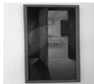
Example 6. An open door (1976)