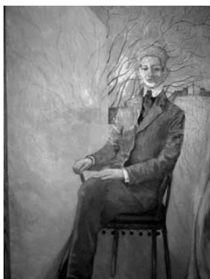
Example 2. The portrait of father (1978)