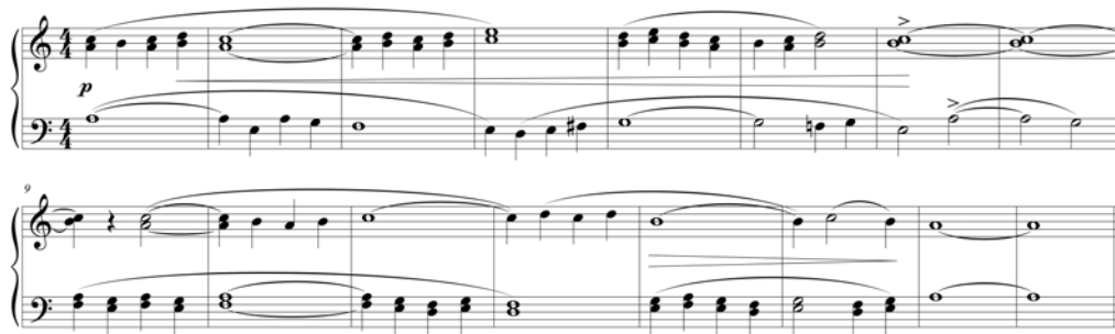
Example 2. Bartók, Mikrokosmos No. 67

the imitated style (Baroque or Classical) may require the resolution of the dissonance, but the resolution is considerably prolonged and takes place only indirectly in m. 9, separated by a rest.