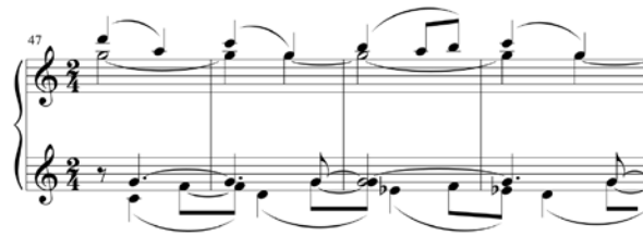
Example 10. Bartók, Mikrokosmos No. 141, mm. 47–50