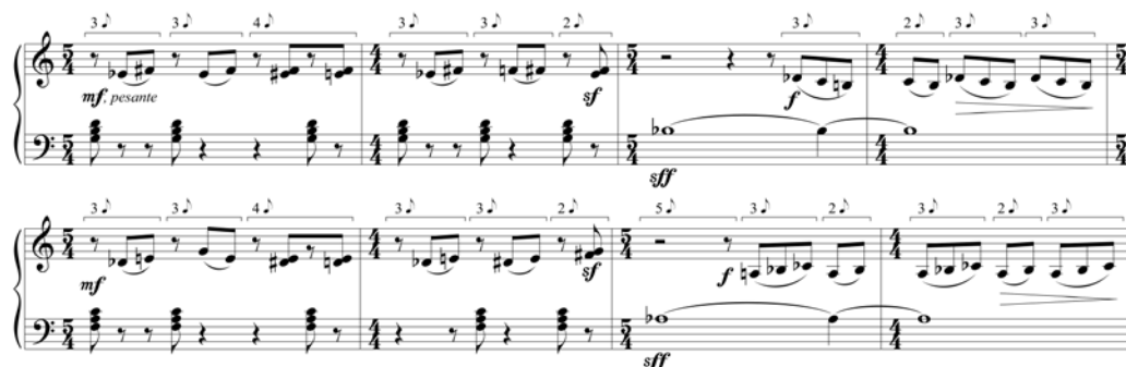
Example 3. Bartók, Mikrokosmos No. 133, mm. 1–8

Second, the rhythmic feature of this piece is not syncopation in the common sense. The measures are divided into small metric units consisting of two to five eighths but no “regular” pulses can be observed, which function as a referential point to the effect of syncopation. Instead, one may relate the characteristic rhythmic feature of this piece to “the so-called Bulgarian rhythm”. 8 Interestingly, in the first half of the piece (up to mm. 17), these units affect the organisation of bar lines, thus there are frequent changes of time signatures (i.e. 4/4 and 5/4, see Ex. 3) and metric units never cross the bar line. In the second half (especially mm. 18–23), the metric units appear essentially independently from the invariable time signature, 4/4 (Ex. 4).