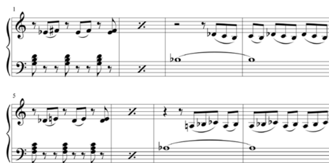
Example 5. Bartók, Mikrokosmos No. 133, the original layer of mm. 1–8 from the draft

A particularly interesting feature of this piece is that Bartók originally wrote the piece in 4/4, and he later introduced the change of time signatures during the process of composition. At the beginning of the piece (mm. 1 and 5), he added an additional beat and then transformed the regular 4/4 into asymmetrical 5/4 (Ex. 5). In the measures corresponding to mm. 11–17 of the published version, it appears that he became uncertain of the proper organisation of measures as he progressed (Ex. 6; above the system, straight lines mark the original, alternative bar lines which were eventually abandoned). Supposedly mm. 11ff. were also originally written in 4/4 throughout but Bartók seemingly revised the bar lines several times until he eventually managed to reach the final version (horizontal brackets show 4/4 measures which might have existed at some point of the compositional process).