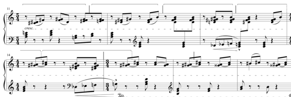
Example 6. Bartók, Mikrokosmos No. 133, mm. 11–17

This brief examination of bar organisation on the basis of the draft can give one example of how Bartók composed: he did not work out the overall structure (including number of measures or beats) in advance – contrary to what Ernő Lendvai's proportional analyses suggest. Rather, Bartók intuitively drafted the piece, and then partly elaborated the rhythm (at mm. 1 and 5) or sought a more appropriate way of notation (mm. 11–17).