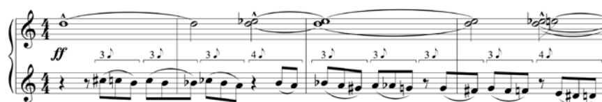
Example 4. Bartók, Mikrokosmos No. 133, mm. 18–21

A particularly interesting feature of this piece is that Bartók originally wrote the piece in 4/4, and he later introduced the change of time signatures during the process of composition. At the beginning of the piece (mm. 1 and 5), he added an additional beat and then transformed the regular 4/4 into asymmetrical 5/4 (Ex. 5). In the measures corresponding to mm. 11–17 of the published version, it appears that he became uncertain of the proper organisation of measures as he progressed (Ex. 6; above the system, straight lines mark the original, alternative bar lines which were eventually abandoned). Supposedly mm. 11ff. were also originally written in 4/4 throughout but Bartók seemingly revised the bar lines several times until he eventually managed to reach the final version (horizontal brackets show 4/4 measures which might have existed at some point of the compositional process).