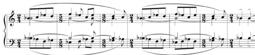
Example 9. Bartók, Mikrokosmos No. 141 , mm. 1–7

The title, “Subject and Reflection”, suggests one of the primary concepts of this piece, the (almost) literal inversion, around the long sustained notes played by the thumb of both hands. 10 Thus, while the right hand plays a phrase b\flat^1-c^2-e\flat^2-d^2-f^2 , the left hand plays b\flat-a\flat-f-g\flat-e\flat , in exact mirror inversion.