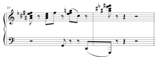
Example 7. Bartók, Mikrokosmos No. 133, mm. 37–38

According to Antokoletz, the eight pitches at the beginning, namely the four chromatic pitches of the right hand ( E_b-E-F-F\# ) and the G major-minor chord of the left hand ( G-B_b-B-D ) shares the common axis of symmetry, E-F (Ex. 8). Strangely, however, he does not deal with the concluding, characteristic non-traditional tetrad ( A\#-C\#-E_b-F\# ) which frequently appears from m. 25 on, and concludes the piece (see Ex. 7).