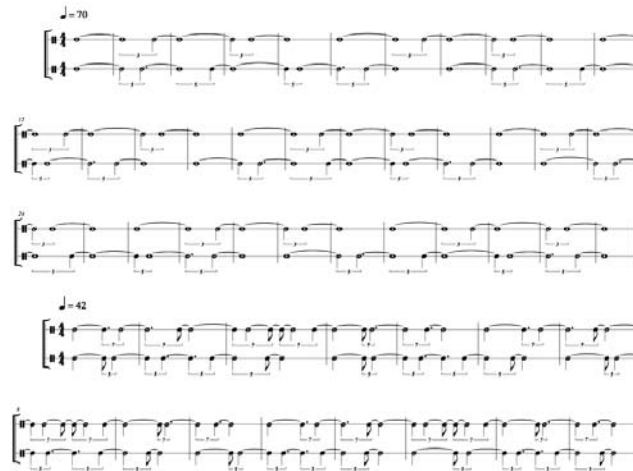
Figure 2. The 35-bar and 15-bar formats of the polyrhythm 21:25, as used in Border Sea

To illustrate how these pre-compositional frameworks have been used in my own practice, consider the example (Fig. 3) taken from the opening of my piece Border Sea (2013) for flute, viola and piano. From the standpoint of temporal architecture, the piece was composed around a polyrhythmic structure of 21:25, which operates in the background as a medium-range formal determinant. Notice that the opening of the piece actually corresponds with Bar 15 of the structural polyrhythm, where an interesting maximally-out-of-phase gesture occurs just before its mid-point. In this example, the music almost completely articulates the highest level of the polyrhythmic background; that is to say, the “background” polyrhythmic structure simply becomes the local rhythmic structure . From a melodic standpoint, the pitches in this opening section derive from an ongoing order permutation pattern based on five chords that unfold in parallel with the polyrhythmic pattern. During composition, individual pitches were selected from this unfolding harmonic stream to create the characteristic opening.