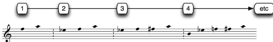
Fig. 2. Unfolding melody

The second main idea of the work is set at bars 11–45. Contrary to the first part, here, Ligeti applies a technique which can be found in most of his major micropolyphonic works, the gradual unfolding of a single or various melodic lines. In particular, during the second part of Melodien (bars 14–29), a melody is gradually unfolded by the flute, the celesta, the xylophone and the violin. Figure 2 shows the first 4 (out of 57) steps of the expansion of the melodic material: